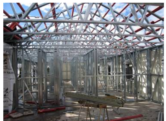
Steel framing © Copyright