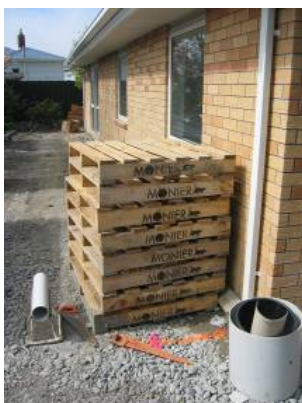
Pallets returned to supplier © Copyright