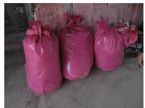
Pink Batts given to the owner for reuse