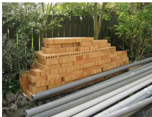
Excess bricks left on-site for reuse by owner